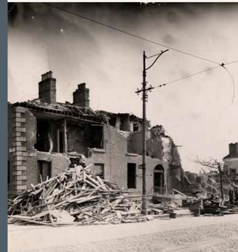
FRONT COVER: DCLA: North Strand Bombing Photographic Collection (1941)

Leabharlanna Poiblí Chathair Bhaile Átha Cliath Dublin City Public Libraries