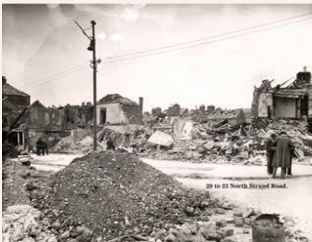
DCLA: North Strand Bombing Photographic Collection (1941)

Students taking the Certificate in Oral History at Dublin City Library & Archive 2018–2019 will be eligible for the Lord Mayor's Prize, which is awarded for the best oral history research project submitted by that class. The Lord Mayor's Prize will be presented during the ceremonial presentation of Certificates in December 2019