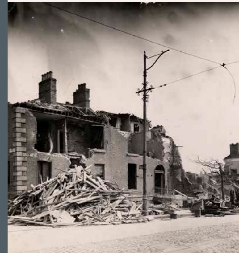
FRONT COVER

Leabharlanna Poiblí Chathair Bhaile Átha Cliath Dublin City Public Libraries