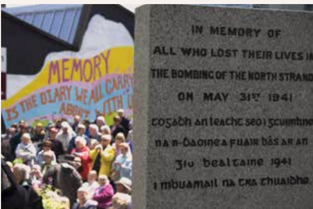
DCLA: Opening of Memorial Garden on 70th Anniversary of bombing, Marino College, May 2011