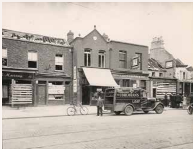
DCLA: North Strand Bombing Photographic Collection (1941)