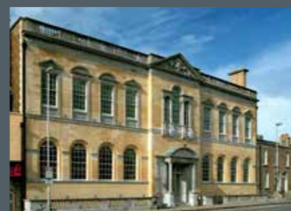
Dublin City Library and Archive facade on Pearse Street

Dublin City Library and Archive, 138–144 Pearse Street, Dublin 2, D02 HE37