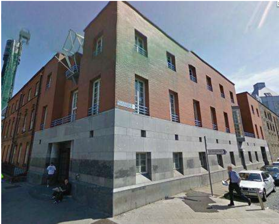
PHOTO OF STRUCTURE

Recommendation: Deletion of Bow Street, New Church Street, Friary Avenue, Dublin 7: Surviving parts of former distillery and ancillary buildings, including chimney and brick walling at Smithfield. Children's Court building at corner of New Church Street and Smithfield from the Record of Protected Structures in accordance with Section 54 and 55 of the Planning and Development Act, 2000.