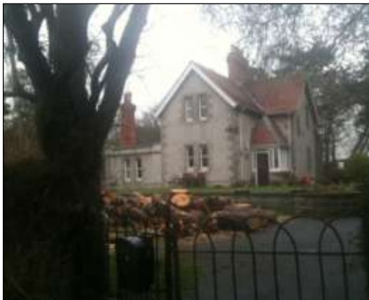
Time- Keepers Lodge