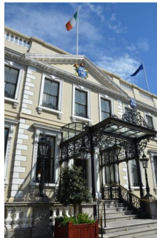
Mansion House Today