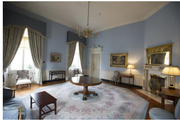
Lady Mayoress's Parlour