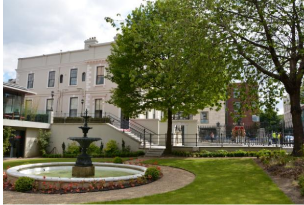
Lord Mayor's Garden

Boasting many fine features and rooms that have rightly allowed it to be compared with other renowned Dublin attractions, such as Trinity College, the National Art gallery and City Hall, the Mansion House started its life faced in brick but was later plastered and had the city coat-of-arms added to its pediment. The Round Room beside the house was built in 1821 for a visit by King George IV. The house would originally have been set in its own wooded grounds but now only a small garden remains.