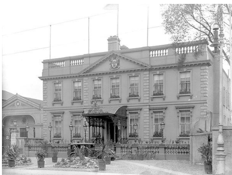
Mansion House 1910

Welcome to the Mansion House – the official residence of Dublin’s first citizen, the Lord Mayor, and one of our cities finest and most loved buildings. Elegantly crafted and beautifully decorated, it tells a powerful story of history and tradition, of respect and honour, of courage and affection.