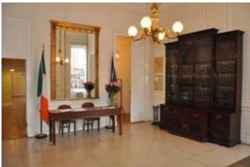
Hallway of the Mansion House

The Lord Mayor and Lady Mayoress may select pictures from Dublin City Gallery The Hugh Lane in Parnell Square to decorate the parlour.