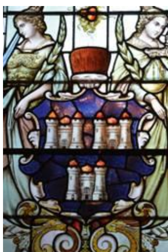
Section of Stain Glass Window

The staircase is noteworthy for the balusters which are three to a step and are admired for their fine spiral turning, known as ‘barley sugar’.